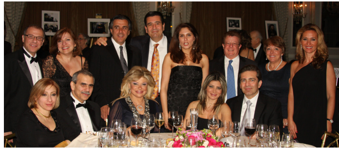
LAU's 2011 2 nd Annual Fundraising Gala in New York City.