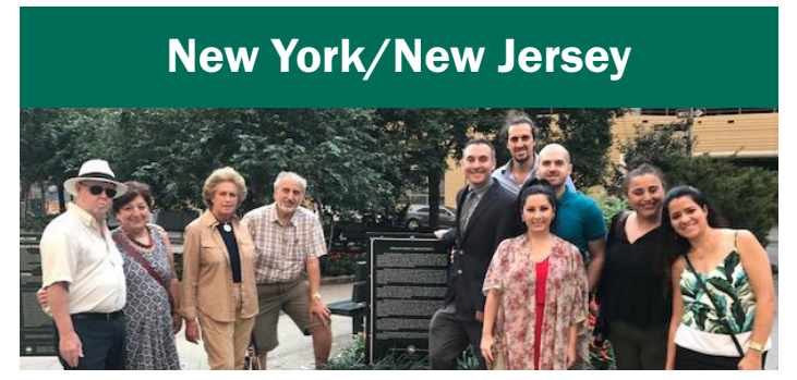
The "Little Syria" walking tour group in lower Manhattan, New York City.