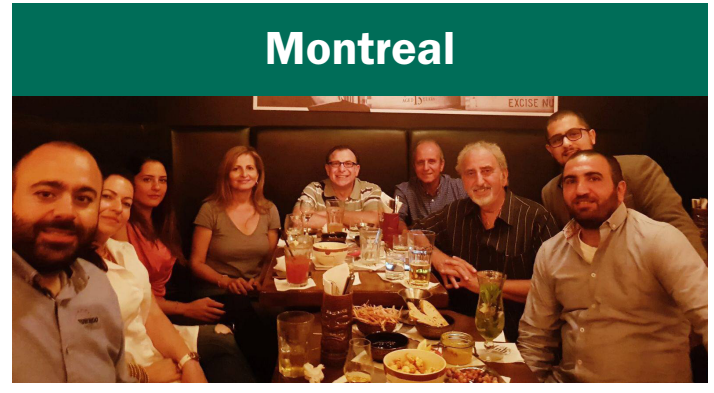
LAU alumni attended a happy hour with the Montreal Alumni Chapter.