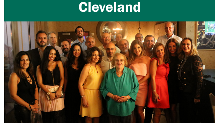
The Ohio alumni gathered for the first time in Cleveland to discuss their future alumni chapter.