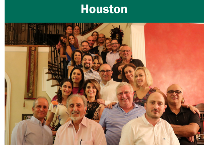
Some of the attendees at the dinner for alumni with current LAU School of Pharmacy students.